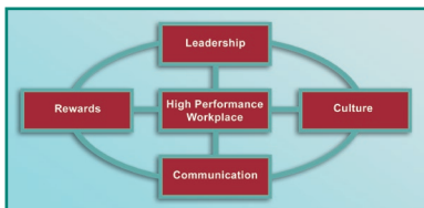
High Performance Workplace Model

This in-house program helps chief executive officers and senior managers develop their leadership potential with the help of an executive coach.